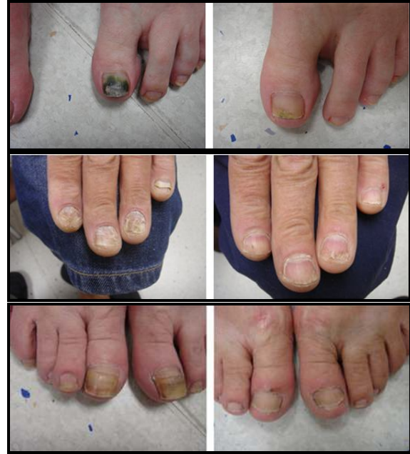
Figure 2. Before (left column) and 2-7 weeks after (right column) nail infected cases treated with the bimodal QSW KTP 532nm and pulsed Nd:YAG 1064nm lasers "ClearChoice" protocol.

All 16 patients reported on significant improvement of nail appearance. Regarding treatment tolerance and post procedure complications, all patients had unanimously pointed out that procedure was tolerable and no complication had occurred during their participation in the study. Dermatologist evaluation of the before and after images was that improvement was substantial in all cases and in an average of 3.125 points (Fig. 2).