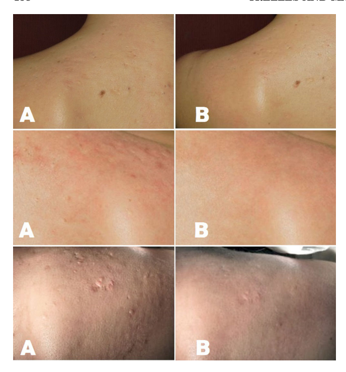
Fig. 5. Patients number 5, 8, and 10 (Table II). Treated areas corresponding to the shoulder and shoulder-blade regions. Atrophic and hypertrophic scarring can be observed (\mathbf{A}) , where the less pronounced scars disappear completely, and fading of the more severely pronounced scars occurs. Results at the end of the trial (6 months) (\mathbf{B}) .

Different radiofrequency methods on their own have been very effective in reducing facial acne scarring, with clear advantages over other methods, according to the researchers [2–6]. Three previous studies have evaluated the efficacy of Legato in the treatment of striae distensae [9,10] and hypertrophic scars [11]. The method of applying the Pixel RF was similar (not sufficiently detailed), but the Impact module was used to inject platelet rich plasma, retinoic acid, and triamcinolone, respectively. The results in both cases were surprising, striae were diminished by more than 60% [9] and hypertrophic scars practically disappeared [11].